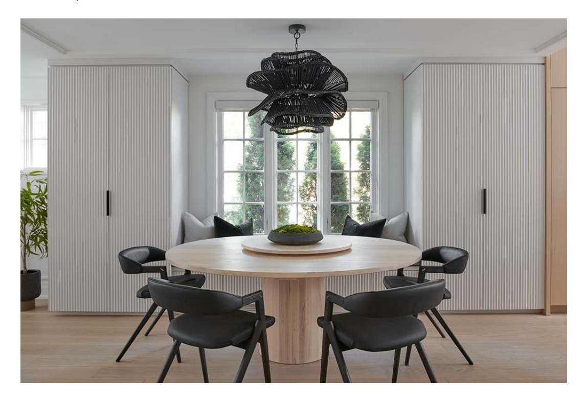
"There is a sense of personal responsibility and fulfillment in knowing that the products you purchase are mindfully and sustainably manufactured," says Sakic.

Bringing elements of the natural world indoors is a crucial facet of quiet luxury design today. Incorporate natural materials such as wood, stone, and live plants to establish a connection with nature. Spacious windows that welcome ample natural light and picturesque views can elevate the sense of tranquillity and luxury in your home. And of course, incorporating earth- friendly fabrics and furniture into your design is the ultimate way to embrace nature.